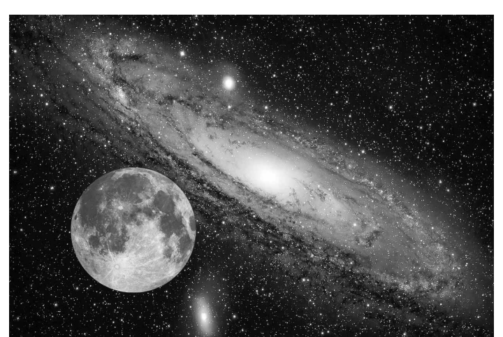
The Moon and the Andromeda Galaxy never get this close to one another in the sky, but this photo shows their comparative size. If Andromeda was very bright, as pictured, it would take 6 Moons to span its length. This image of the galaxy does not show the extremities of the galaxy. Many galaxies and nebulae span an area in the sky greater than that of the Moon, but because they are very faint, this evades attention and these faint objects do seem smaller than the Moon when viewed in a telescope—but they are not!

In the northern hemisphere, we use the same constellations described by (visible to) the ancient Greeks, but a few have been added since then.